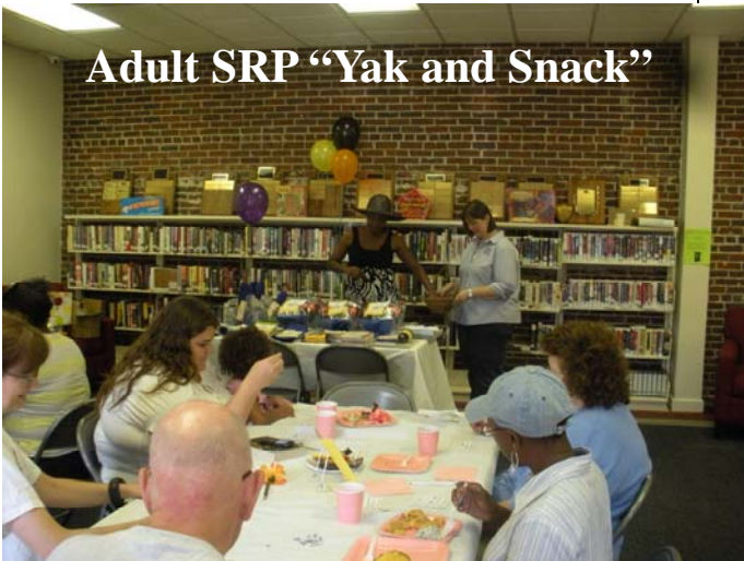
Adult SRP "Yak and Snack"

Adults Registered: 50 Number of Programs: 5 Total Attendance: 80