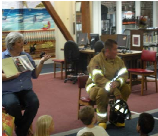
Pluggie and the Fire Department visit for Story Time